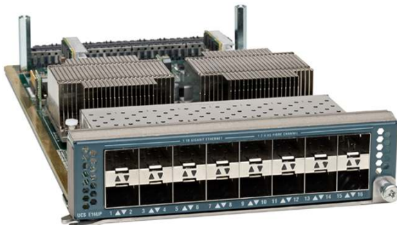
Figure 5. Unified Port 16-Port Expansion Module

The Cisco UCS 6200 Series supports an expansion module that can be used to increase the number of 10 Gigabit Ethernet, FCoE and FC ports (Figure 5). This unified port module provides up to 16 ports that can be configured for 10 Gigabit Ethernet, FCoE and/or 1/2/4/8-Gbps native Fibre Channel using the SFP or SFP+ 3 interface for transparent connectivity with existing Fibre Channel networks.